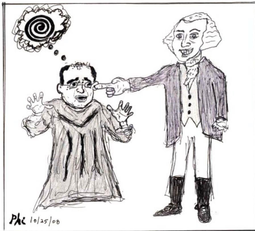
Scalia's Worst Nightmare: A Wet Willy From Washington